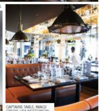
CAPTAINS TABLE, IMAGE CREDIT: LISA NESTORSON