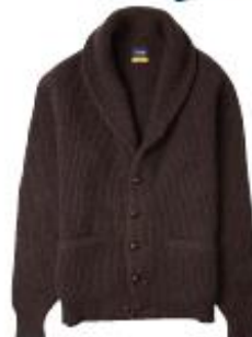
CARDIGAN, £395, DRAKES.COM