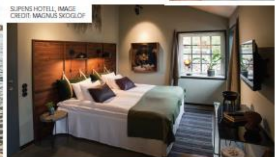
SLIPENS HOTELL