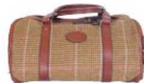
BAG, £675, RICHARDANDERSONLTD.COM