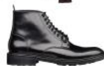
BOOTS, £299, TIGEROFSWEDEN.COM