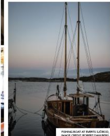
FISHING BOAT AT EVERTS SJÖBOD