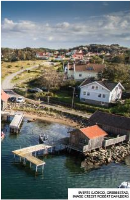
EVERTS SJÖBOD, GREBBESTAD