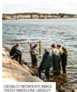
CATXALOT WORKSHOP