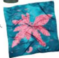
SCARF, £255, ETRO.COM