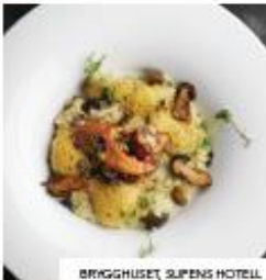
BRYGGHUSET, SLIPENS HOTELL