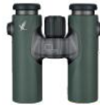
BINOCULARS, FROM £910, SWAROVSKIOPTIK.COM